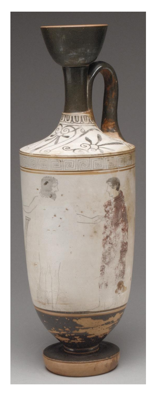
Hermes bringing a dead youth to Acheron where Charon awaits New York, Metropolitan Museum of Art, 21.88.17